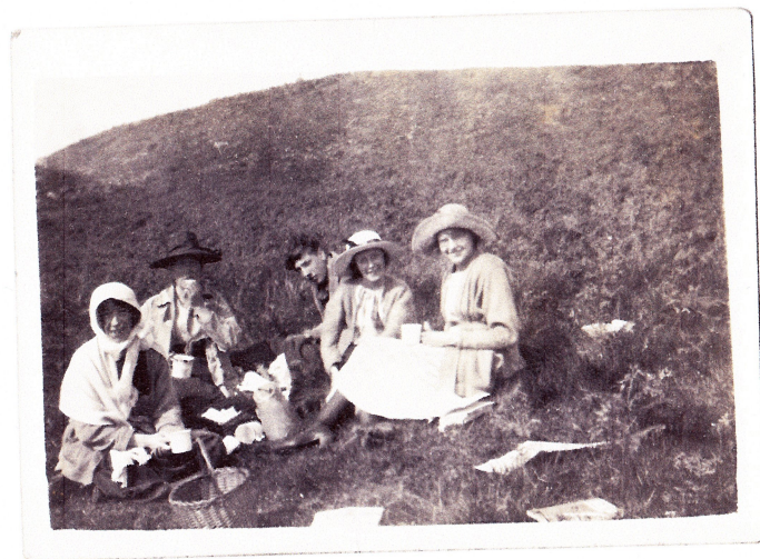
Picnic on the moor.